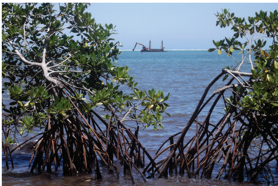
OLSSI FOR GFC/CCRI

Villages of Toamua, Saina and Vaiusu in Samoa.