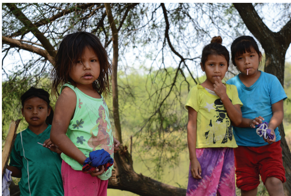
INES FRANCESCHELLI FOR GFC/CCRI

Community of La Esperanza, Lower Chaco region, western Paraguay.